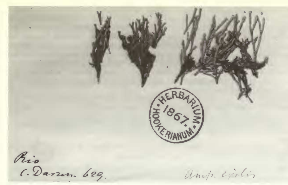
Fig. 2 Darwin 629, syntype specimens of Amphiroa exilis Harvey from Rio de Janeiro, collected in 1832.

There is a description of this Amphiroa on page 56 of the Zoological Diary (briefly paraphrased by Sloan, 1985: 99). It is indicated ' Amphiroa ', '282 Spirits', and '595', the latter added later in pencil, in the margin (i.e., number 282 preserved in spirits, number 595 dried). There is a drawing of a specimen at the beginning, and '(a)' and '(B)' in the text refer to this drawing. An '(a)' in the margin opposite the second line of text refers to footnote (a) on page 55, verso, which reads: '(a) 282 & (595 not spirits),' the parentheses added later. The page has a vertical line pencilled through it.